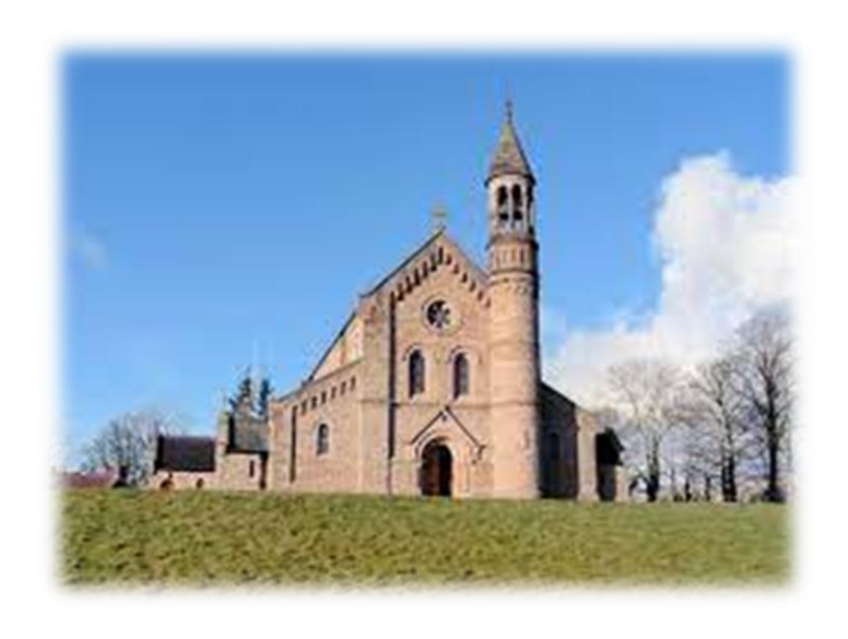
Holy Week & Easter Mass Times at St Michael's Church, Lissan

Holy Thursday – Mass at 7 pm Good Friday – Passion at 3 pm Good Friday – Stations of the Cross at 7 pm Holy Saturday Vigil – Mass at 8.30 pm Easter Sunday – Mass at 10.30 am